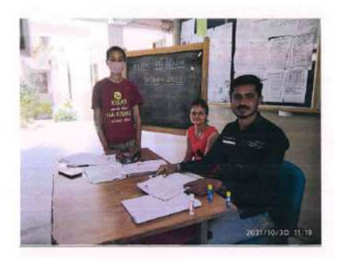
Voter awareness and card awareness