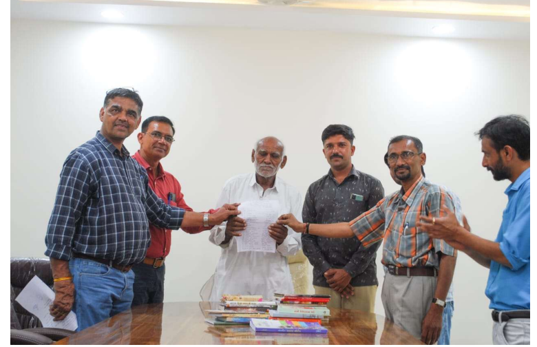
Donation of Books to village library by college during NSS camp