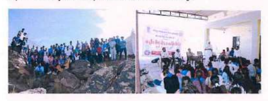
Day 7 - The camp valedictory function was held at the college.

6 - The volunteers were taken to trek Chandrua hill and shared their experiences with other teams.