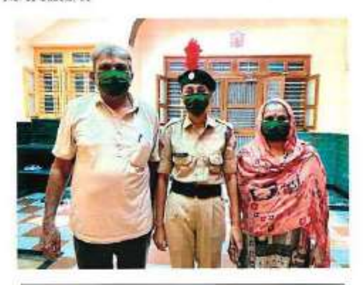
4. NCC Cadet Visited Old age homes During pandemic lockdown.

NCC Cadet of R R Lalan college volunteered themselves to Fight the corona virus spread and they helped Local Police force in maintaining social distance. Use of Mask etc. They Worked in Covid control room on covid helpline desk to assist the people during crisis.