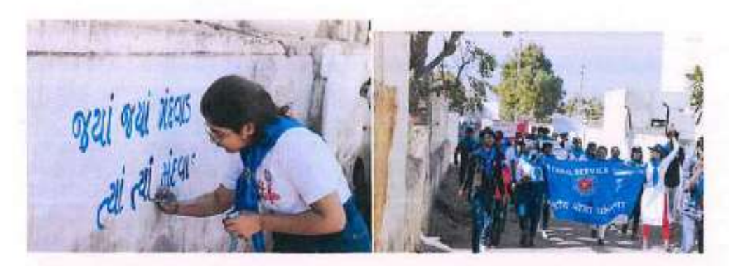
Day 5 - The fifth day was taken over by the faculty members of Economics department of the college. They collected census data of the village and conducted a survey of the demographics.