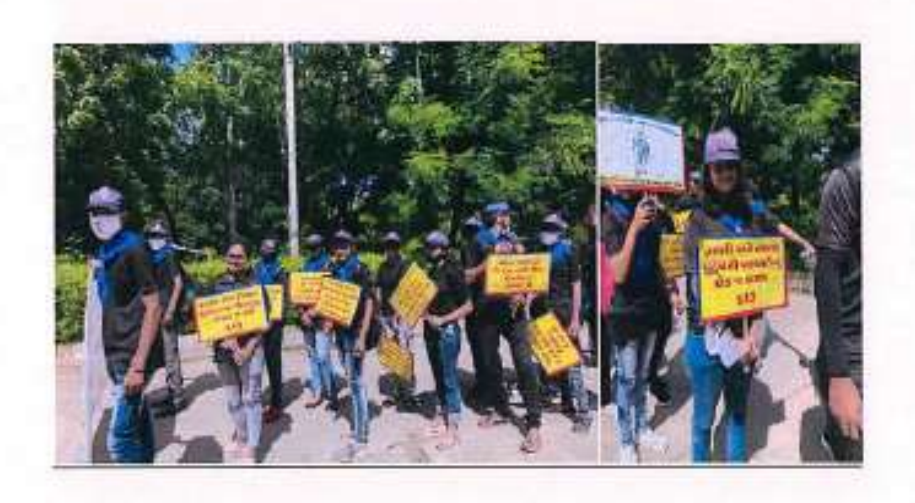
(Anti-narcotics day celebration)