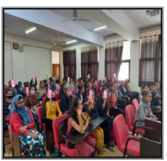
Training for Girls Safety by 181 Police helpline staff