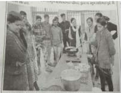
क्षांत्रक कोर्चेच्या कुनिय क्षांत्रकः । पूरणी नाम साथ साथ साथ प्रत्य प्रत्य प्रत्य प्रत्य क्षांत्र कृष्णि कार्य कार्याचेन कार्याच्या प्रत्य कार्याच्या कार्याच्या कृष्णि कार्याच्या कार्याच्या कार्याच्या कार्याच्या कार्याच्या कार्याच्या कार्याच्या कार्याच्या कार्याच्या कार्याच्या कार्याच्या कार्याच्या कार्याच्या कार्याच्या कार्याच्या कार्याच्या कार्याच्या कार्याच्या कार्याच्या कार्याच्या कार्याच्या कार्याच्या कार्याच्या कार्याच्या कार्याच्या कार्याच्या कार्याच्या कार्याच्या कार्याच्या कार्याच्या कार्याच्या कार्याच्या कार्याच्या कार्याच्या कार्याच्या कार्याच्या कार्याच्या कार्याच्या कार्याच्या कार्याच्या कार्याच्या कार्याच्या कार्याच्या कार्याच्या कार्याच्या कार्याच्या कार्याच्या कार्याच्या कार्याच्या कार्याच्या कार्याच्या कार्याच्या कार्याच्या कार्याच्या कार्याच्या कार्याच्या कार्याच्या कार्याच्या कार्याच्या कार्याच्या कार्याच्या कार्याच्या कार्याच्या कार्याच्या कार्याच्या कार्याच्या कार्याच्या कार्याच्या कार्याच्या कार्याच्या कार्याच्या कार्याच्या कार्याच्या कार्याच्या कार्याच्या कार्याच्या कार्याच्या कार्याच्या कार्याच्या कार्याच्या कार्याच्या कार्याच्या कार्याच्या कार्याच्या कार्याच्या कार्याच्या कार्याच्या कार्याच्या कार्याच्या कार्याच्या कार्याच्या कार्याच्या कार्याच्या कार्याच्या कार्याच्या कार्याच्या कार्याच्या कार्याच्या कार्याच्या कार्याच्या कार्याच्या कार्याच्या कार्याच्या कार्याच्या कार्याच्या कार्याच्या कार्याच्या कार्याच्या कार्याच्या कार्याच्या कार्याच्या कार्याच्या कार्याच्या कार्याच्या कार्याच्या कार्याच्या कार्याच्या कार्याच्या कार्याच्या कार्याच्या कार्याच्या कार्याच्या कार्याच्या कार्याच्या कार्याच्या कार्याच्या कार्याच्या कार्याच्या कार्याच्या कार्याच्याच्या कार्याच्याच कार्याच्या कार्याच्या कार्याच्याच्या कार्याच्याच कार्याच कार्याच्याच कार्याच्याच कार्याच कार्याच कार्याच कार्याच कार्याच कार्याच कार्याच कार्याच कार्याच कार्याच कार्याच कार्याच कार्याच कार्याच कार्याच कार्याच कार्याच कार्याच कार्याच कार्याच कार्याच कार्याच कार्याच कार्याच कार्याच कार्याच कार्याच कार्याच कार्याच कार्याच कार्याच कार्याच कार्याच कार्याच कार्याच कार्याच कार्याच कार्याच कार्याच कार्याच कार्याच कार्याच कार्याच कार्य