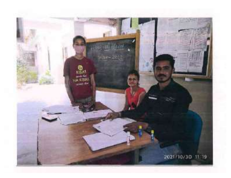
Voter awareness and card awareness