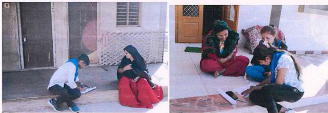
Day 6 – The volunteers were taken to trek Chandrua hill and shared their experiences with other teams