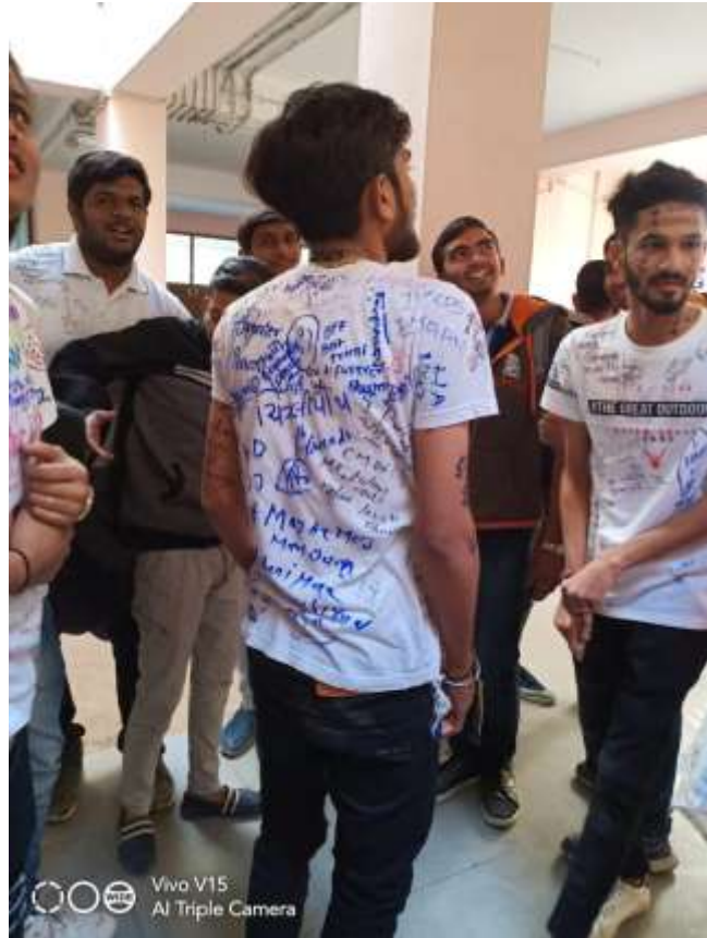
Signature day celebration