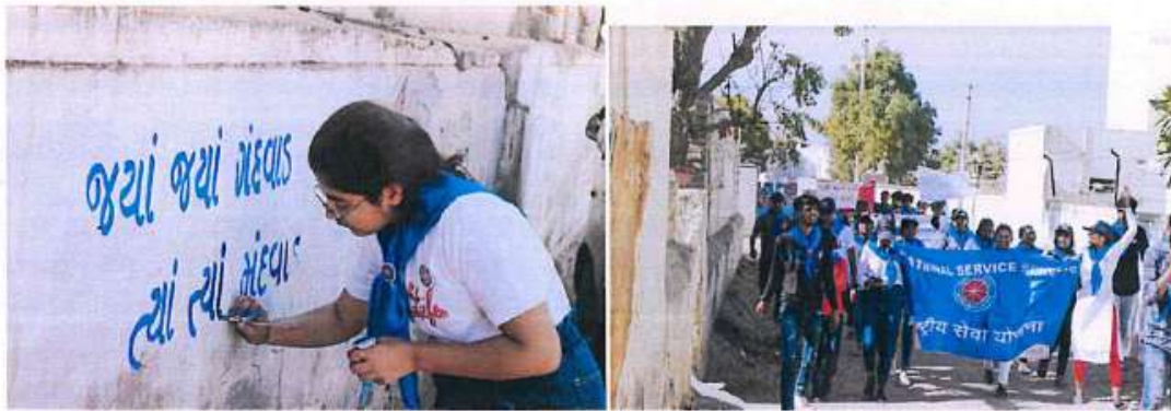
Day 5 – The fifth day was taken over by the faculty members of Economics department of the college. They collected census data of the village and conducted a survey of the demographics.