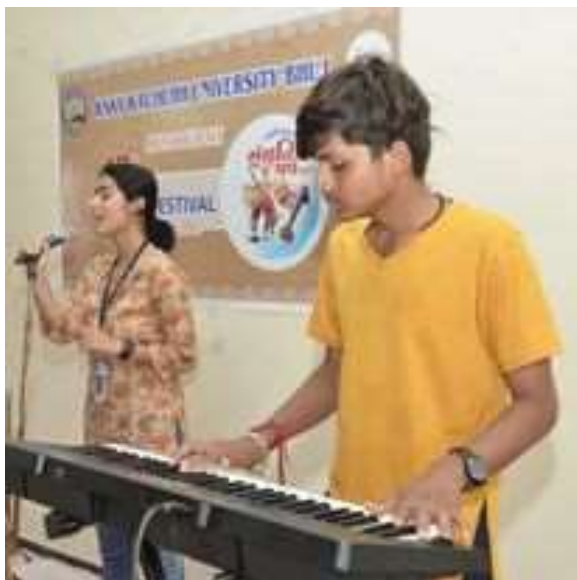
At youth festival