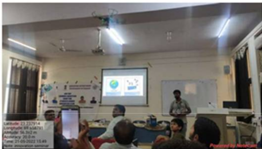
Summer camp cum training for Colleges form Kachchh District