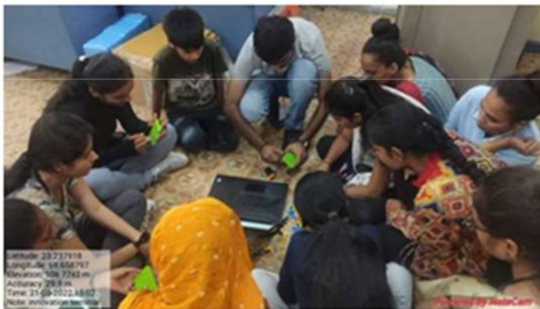
Two Workshop on Innovation Expo by experts from KCG