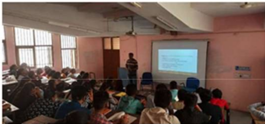
Motivating student for Entrepreneurship